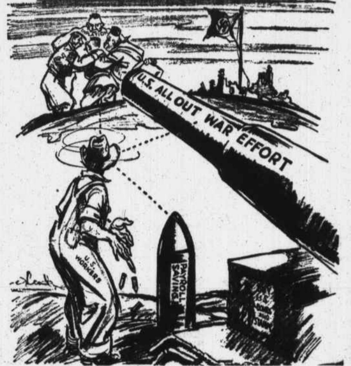
FIGURE IT OUT YOURSELF