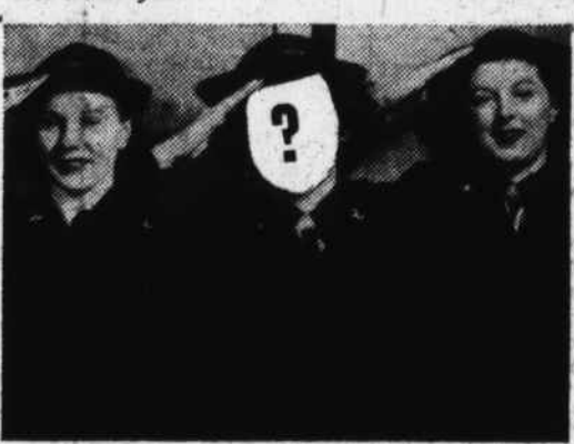
PRIDE Put yourself in this picture—as enother North Carolina girl doing a grand job —helping win the war—as a WAVE! You'll find it the best job you've had—more exciting, more important, more appreciated, with more chance for real advancement! Yes, you'll take pride in being a WAVE—backing up North Carolina fighting men as North Carolina women have always done—in every war our country has fought!