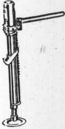
Bumper Jacks $2.65 ea.