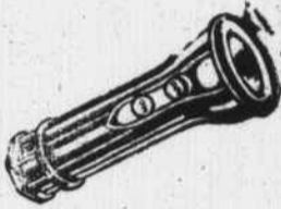
Flashlights with Batteries $1.50 ea.