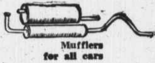
Mufflers for all cars