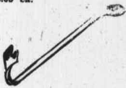
Wrecker Bars 45c ea.