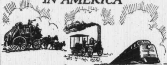
WHEN THE STAGECOACH GAVE WAY TO THE RAILROAD TRAIN—