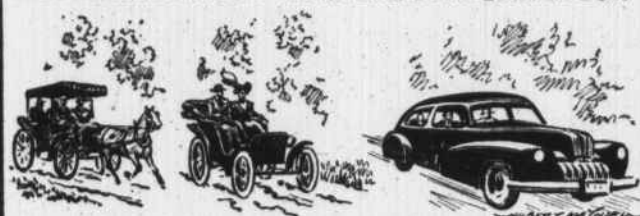
WHEN THE HORSE AND CARRIAGE WAS SUCCEEDED BY THE AUTOMOBILE—

IT MEANT INCREASED PRODUCTIVE CAPACITY FOR THE NATION—MORE JOBS AND MORE PRODUCTIVE JOBS FOR THE PEOPLE. AND THE BENEFITS HAVE ACCRUED TO ALL OF US IN THE FULLER MEASURE OF LIVING THAT HAS COME TO DISTINGUISH OUR DYNAMIC DEMOCRACY.