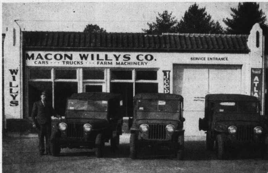
The photo above is a view of the Willys place on Palmer Street, Franklin, N. C., opposite Cagle's Cafe.

The Universal JEEP is now ready to work at hundreds of jobs.