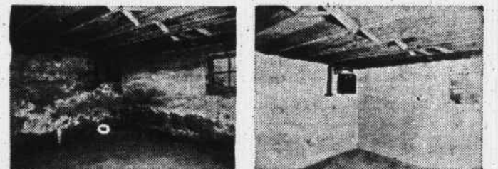
Before Aquellizing cellar walls are damp and unsightly. After Aquellizing walls are clean, white and room is dry.

The Scientific Mineral Surface Coating that was used to control water seepage and dampness in the Maginot Line when other materials failed!