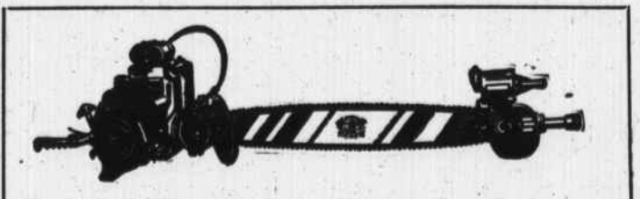
DISSTON CHAIN SAW

International Crawler Tractors, Industrial Wheel Tractors and Power Units