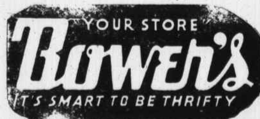
Figure your savings! The more you buy the more you save! Come in early! Save disappointment! First come, first served!

Opportunity of a lifetime! This low price is subject only to present stock on hand! See our windows! Remember, 10% down makes a Lay-By!