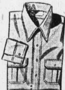
Sturdy twill shirt with two pockets. All reinforced.