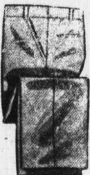
Heavy pants that can stand plenty of abuse. Wear and wear.

Overalls, pants, shirts, gloves, jackets—meant for hard work... made to withstand wear and strain. Choose your work clothes here. All budget-priced.