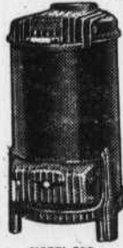
MODEL 520 Draft Regulator for Models 520 and 522 available at small cost.

Heats All Day and Night Without Refueling The WARM MORNING employs amazing, patented, interior construction principles which result in remarkable heating efficiency at low cost.