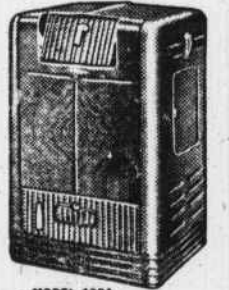
MODEL 420A With Built-in Automatic Draft Regulator.