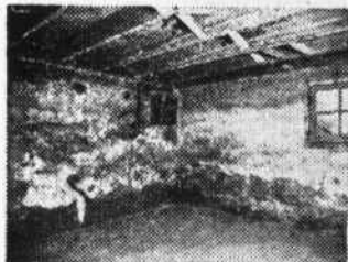
Before Aquellizing cellar walls are damp and unsightly.