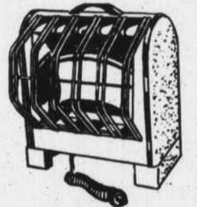
Economaster ELECTRIC HEATER