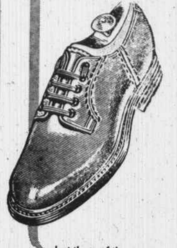
Just three of the many

reasons why this Cadillac style is setting the pace across America. Come in today for your pair.