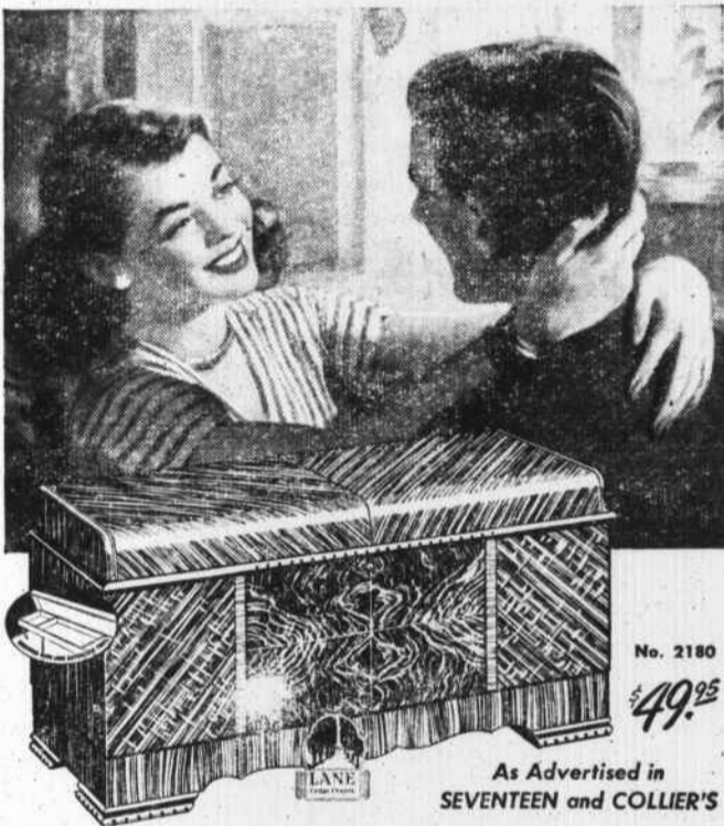
No. 2180 $49.95 As Advertised in SEVENTEEN and COLLIER'S