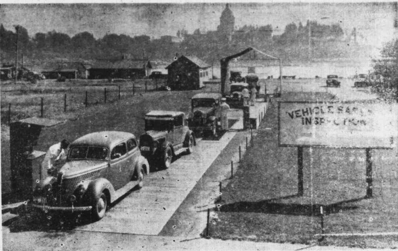
HOW YOUR CAR WILL BE INSPECTED —This is a safety inspection lane, typical of the one your car will pass through when the new mechanical inspection program goes into effect in January. According to statistics of the National Safety Council, 17 per cent of all motor vehicle accidents are caused by automobiles with faulty equipment. The mechanical inspection program was passed by the 1947 general assembly—"for your safety"—to reduce North Carolina's high accident and fatality rates. The new law requires inspection of all vehicles once during 1948, and twice a year thereafter. Three principal points that will be stressed in the inspection program are seeing, steering, and stopping, which will take care of lights, brakes, steering assembly, mirrors, horn, windshield wiper, wheel alignment, and tires.

October, 1947, traffic on N. C. highways set a record for that month.