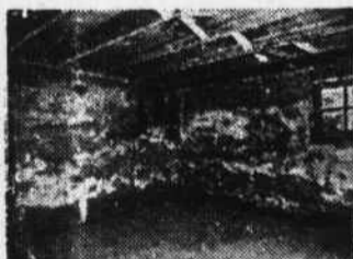
Before Aquellizing cellar walls are damp and unsightly.