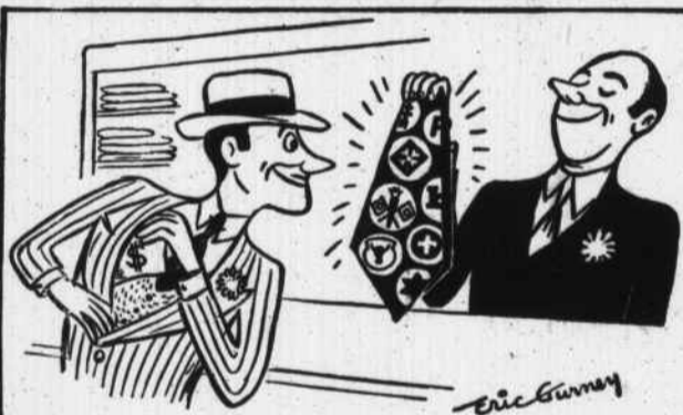
"This is very smart—they got the idea from hidden designs you'll find under Pepsi-Cola bottle tops."