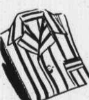
Men's Broadcloth Pajamas

Now that warm weather is here, he will be ready for his summer pajamas. We have them in beautiful striped patterns.