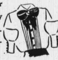
Gibson Girl Blouse