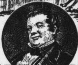
WASHINGTON IRVING APR. 3, 1783—NOV. 28, 1859

IRVING'S WAS ONE OF THE FIRST LITERARY VOICES IN AMERICA THAT HIS OWN COUNTRYMEN LISTENED TO AND OTHER NATIONS PRAISED...PIONEERING TO LIFT AMERICAN WRITING FROM PROVINCIALISM TO A PLACE IN WORLD LITERATURE, IRVING HELPED BUILD THE AMERICAN CULTURAL TRADITION IN ARTS AND LETTERS THAT CONTINUES TO BE, TO ALL OF US, A SOURCE OF PRIDE AND INSPIRATION IN OUR DEMOCRACY.