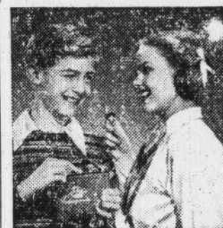
Get the whole family in!

How'd you like to win $25,000.00 cash? Here's your chance! Pepsi-Cola's great contests offer a top Family Sweepstakes Prize of $25,000.00—among swell cash prizes! Also, State and National cash prizes every month! Lots of chances to win! Enter this sensational new series of Pepsi-Cola contests. Enter often—every entry* gets a Treasure Certificate for the Family Sweepstakes Prizes. Contests close June 30, 1948.