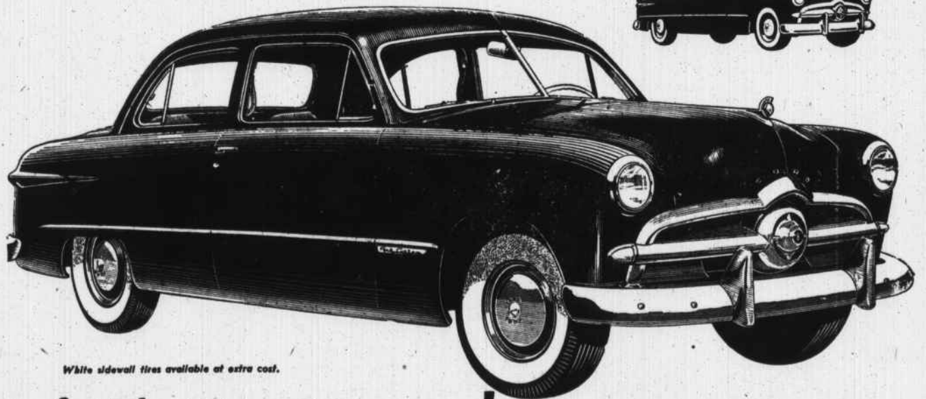
White sidewall tires available at extra cost.