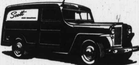
THE 'JEEP' PANEL DELIVERY offers smart appearance together with low operating costs, thanks to low weight and the 'Jeep' Engine.

'JEEP' TRUCKS both 2- and 4-wheel drive, cut hauling costs through long service and low operating and maintenance costs.