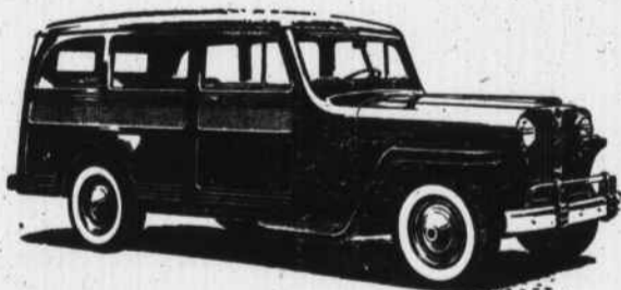
THE 'JEEP' STATION SEDAN is a perfect family car, with the luxury and comfort of a sedan plus the spaciousness of its all-steel station-wagon body.

The first station wagon with all-steel body and top—the 'Jeep' Station Wagon—showed the way to wider practical usefulness and greater safety.