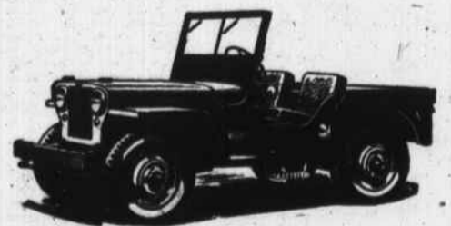
THE UNIVERSAL 'JEEP' is America's most versatile vehicle for farm and industry, serving as tractor, mobile power unit and for hauling.