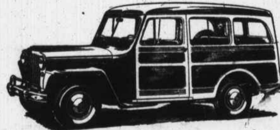
THE 'JEEP' STATION WAGON, with all-steel body and top, is dual-purpose—a smooth-riding passenger car and a practical vehicle for hauling.

This pioneering by Willys-Overland—fitting cars and trucks to actual needs—has brought world-wide success to these more useful, more economical vehicles. We invite you to see how fully Willys-Overland's postwar products meet your transportation and hauling needs.