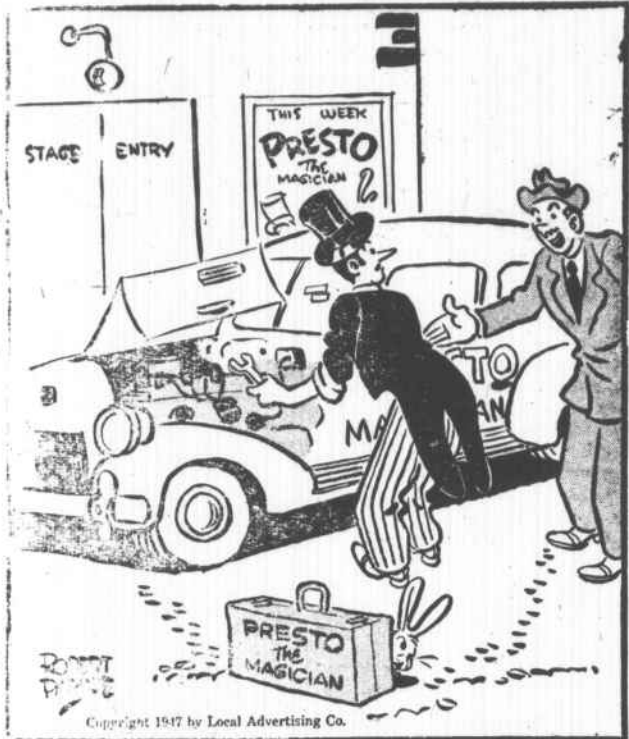
"BURRELL MOTOR CO., INC. works magic with car troubles—call 123."