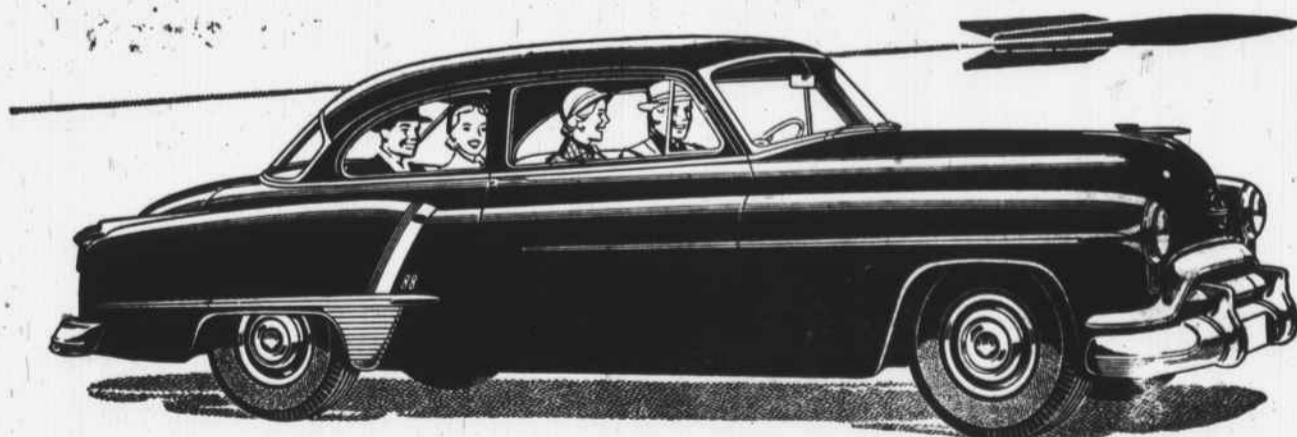
Above, Oldsmobile Super "88" 2-Door Sedan. Hydra-Matic Drive optional at extra cost. Equipment, accessories, and trim illustrated subject to change without notice.