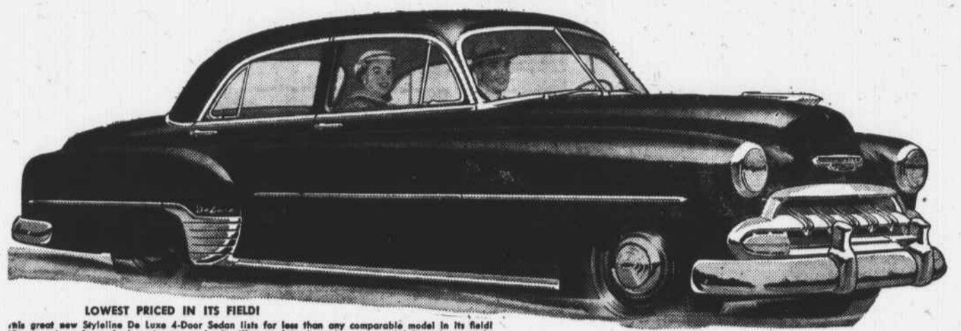
LOWEST PRICED IN ITS FIELD This great new Styline De Luxe 4-Door Sedan lists for less than any comparable model in its field (Continuation of standard equipment and trim illustrated is dependent on availability of material.)

The Styline Deluxe 4-door Sedan DELIVERED IN FRANKLIN