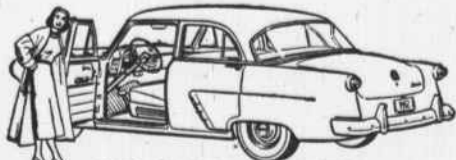
NEW COACHCRAFT BODIES

NOW! 110-h.p. High-Compression STRATO-STAR V-8!