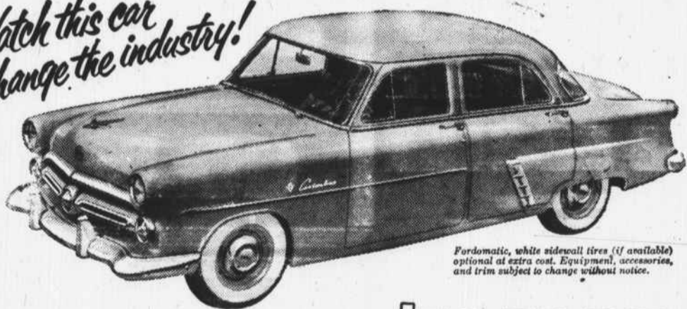
Fordomatic, white sidewall tires (if available) optional at extra cost. Equipment, accessories, and trim subject to change without notice.

Here's the big new '52 FORD ... most powerful car in its class!