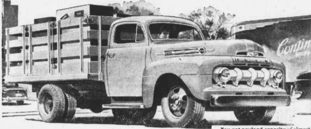
You get payload capacity of almost 2½ tons in this Ford light-duty F-4 Stake! All-new Low-Friction 101-h.p. Six, or 106-h.p. V-8.