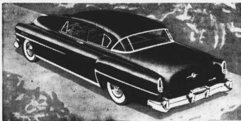
The beautiful new Chrysler Windsor Club Coupe