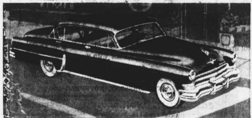
The majestic new Chrysler Custom Imperial 4-door Sedan