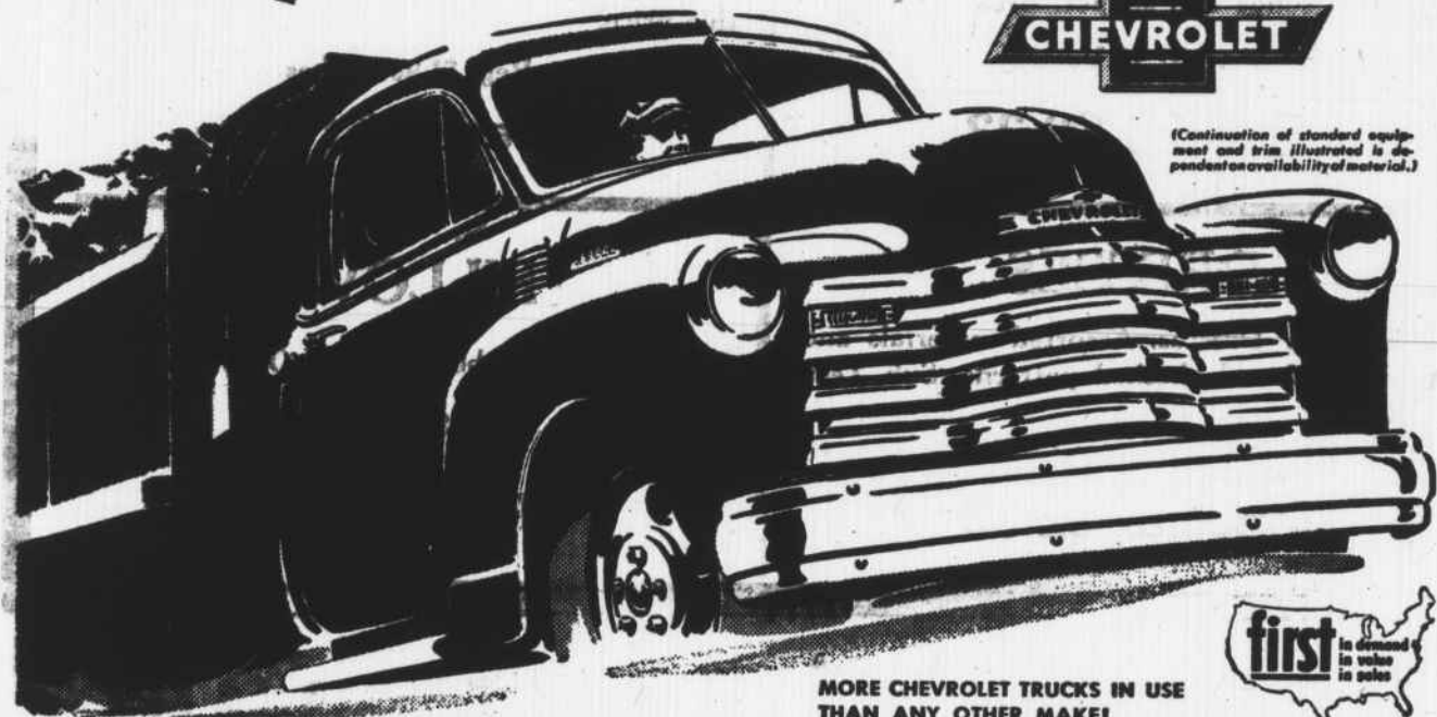
(Continuation of standard equipment and trim illustrated in dependent availability of material.)

New stamina plus extra gasoline economy in heavy-duty models with Loadmaster engine, reduces hauling costs per ton-mile.