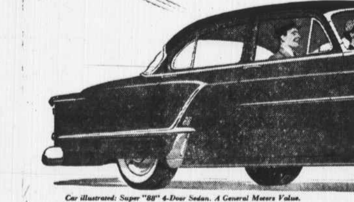
Car illustrated: Super "88" 4-Door Sedan. A General Motors Value.