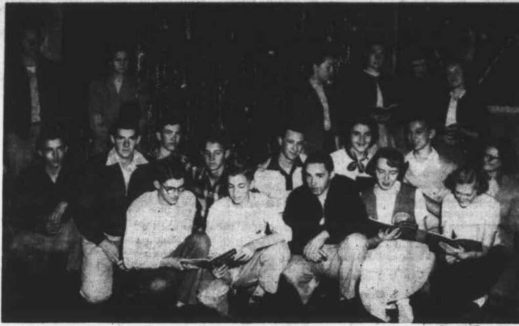
The floor space taken up around the Christmas tree by the above Franklin High students is now filled with gifts for the needy, a "whole truck load", according to school officials. The collection of gifts started as a spontaneous thing and mushroomed into a flood of clothing and food. Students will distribute the gifts Christmas.

More than $62,000 will be offered as premiums this year at the N. C. State Fair in Raleigh, October 20-24.