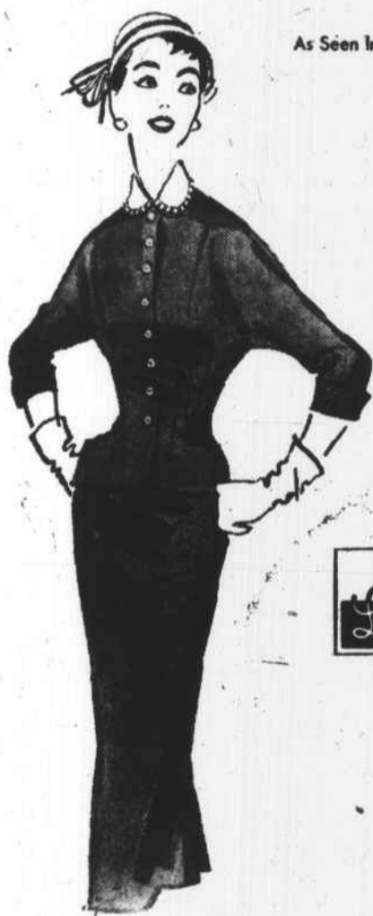
As Seen In Mademoiselle