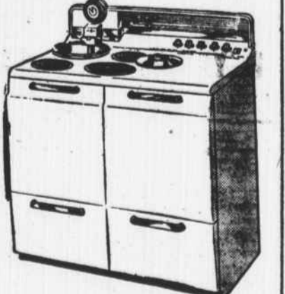
Hotpoint Special Super-Oven automatic Electric Range • Golden Bake Calrod unit Super-Calrod instant heat • Raisable deep-well-cooker • 3 deep storage drawers 1954 Model RB-57 ..... $269 95