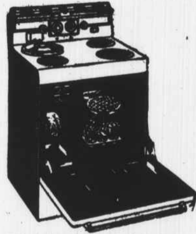
Hotpoint De-Luxe Super-30 lighted pushbutton automatic Electric Range • Rotary electric barbecue • Rotary electric barbecue • Raisable deep well cooker • Hotpoint giant Super Oven • Super Calrod instant heat 1954 Model RH-1 ..... $365 00