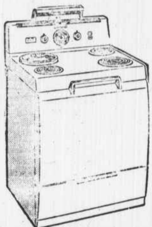
Hotpoint Standard Super-30 pushbutton automatic Electric Range • Raisable deep-well cooker • Calrod Golden Bake unit • New Crisp-Stor compartment • Automatic time center control 1954 Model RG-1 ..... $265 00