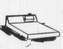
CALROD GOLDEN GRIDDLE Makes perfect griddle-cakes, hamburgers, etc. Always the right heat automatically. Optional unit plugs into control panel.

No Other Range Line Offers You All These Features