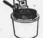
DEEP-FAT FRYERS Features Calrod Golden Fryer plugs into back panel. Automatic heat control. This optional unit makes all french-fried foodstuffs and delicious!

You Also Have HUNDREDS OF CHANCES to win a valuable cash-allowance award! Good for DOLLARS toward the purchase of a brand-new Hotpoint Electric Range of your own selection!