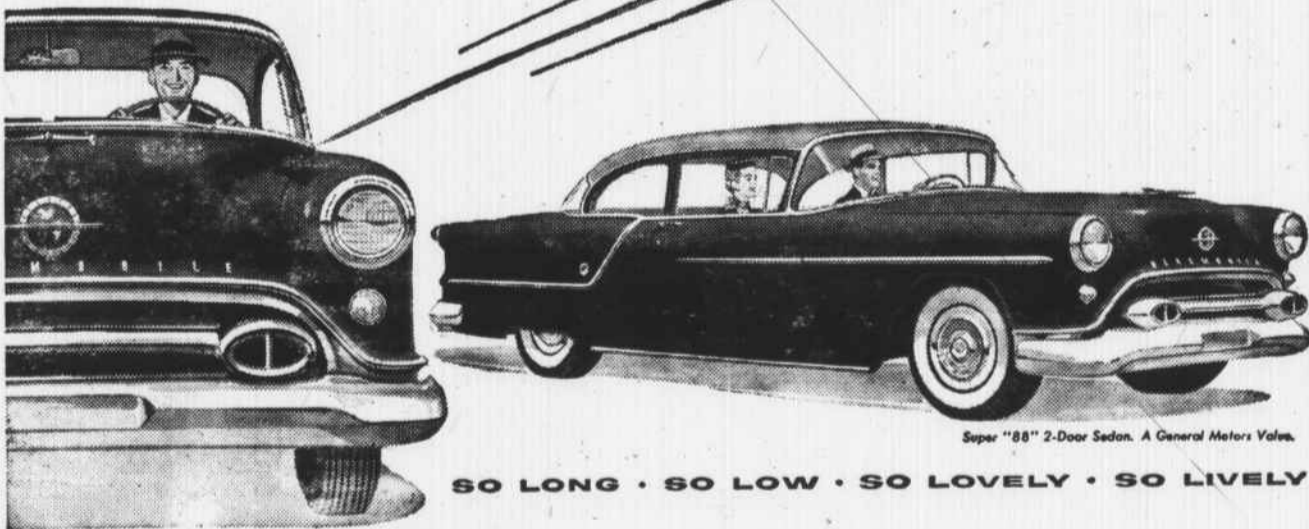
Super "88" 2-Door Sedan. A General Motors Value.

SO LONG • SO LOW • SO LOVELY • SO LIVELY