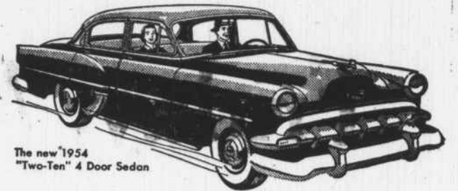
The new 1954 "Two-Ten" 4 Door Sedan

Famed Knee-Action Ride —Chevrolet gives you the only Unitized