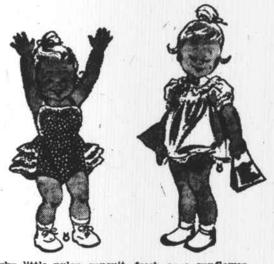
perky little nylon sunsuit, fresh as a sunflower. elegant little dress of Swiss organdy, hand-smocked, with embroidered eyelet trim.

pamper your baby with the prettiest duds in the world from our marvelous collection of pint-size summer fashions that are cute as a baby bug's ear!