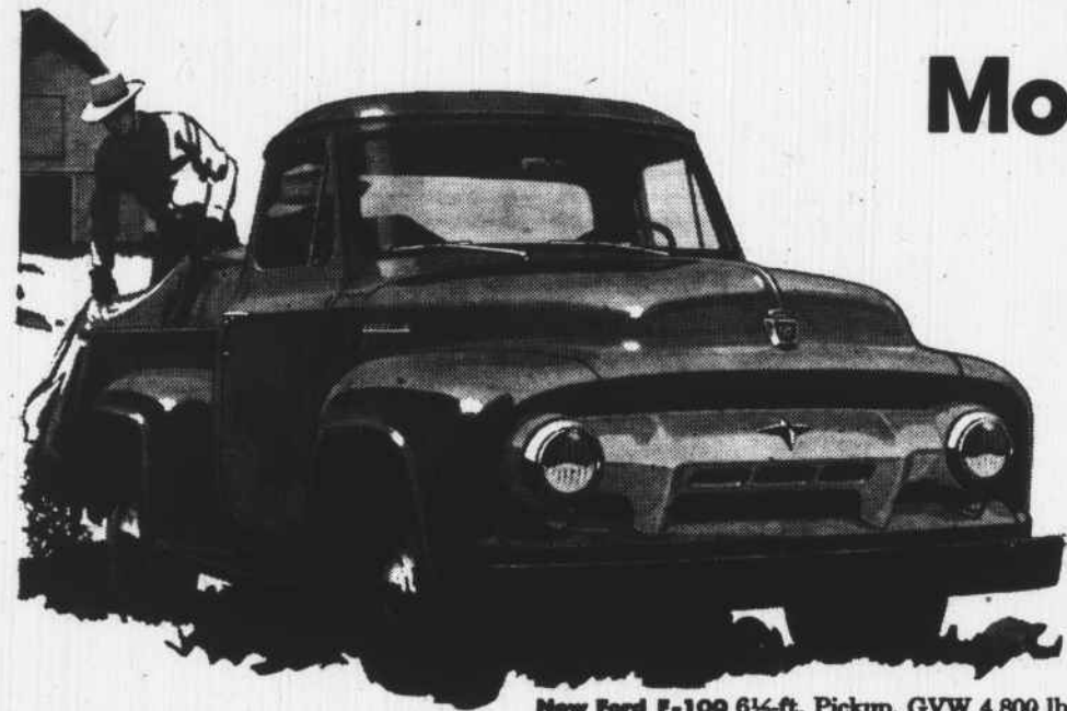
New Ford F-100 6 1/2-ft. Pickup, GVW 4,800 lbs.