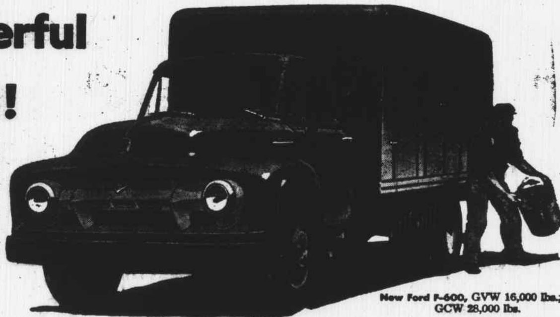
New Ford F-600, GVW 16,000 lbs.; GCW 28,000 lbs.

With its new 138-h.p. Power King V-8 engine, the new Ford F-600 is the most powerful of the six leading-make "2-tonners." Three-engine choice includes 130-h.p. V-8 and 115-h.p. Six. Choice of two single-speed rear axle ratios. Optional 2-speed axle with choice of two ratios. All transmission options are Synchro-Silent type: 4-speed, 5-speed direct- or 5-speed overdrive.