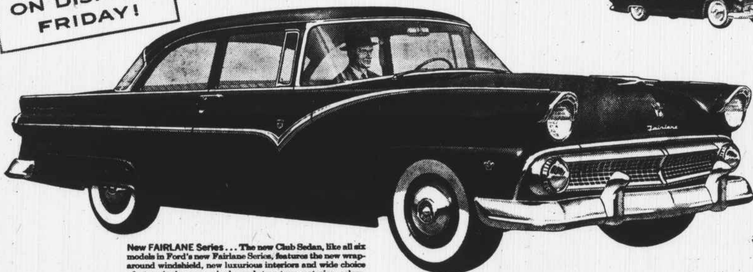
New FAIRLANE Series... The new Club Sedan, like all six models in Ford's new Fairlane Series, features the new wrap-around windshield, new luxurious interiors and wide choice of stunningly new, single and two-tone exterior colors.

Longest, Lowest, Roomiest...most Powerful ever built!