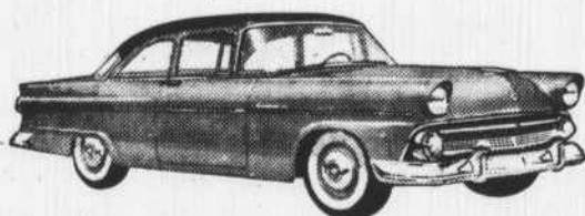
New CUSTOMLINE Series... The Tudor Sedan (above) and Fordor offer a wide selection of new color and upholstery combinations. Like all '55 Fords, they have a new wider grille, new visored headlights and sturdier, extra-narrow pillar-posts for better visibility.

Longest, Lowest, Roomiest...most Powerful ever built!