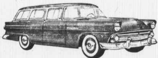
New STATION WAGON Series... The new 6-passenger, 4-door Country Sedan (above) is one of five new do-it-all beauties. There's also an 8-passenger Country Sedan, an 8-passenger Country Squire and a 2-door, 6-passenger Ranch Wagon and Custom Ranch Wagon.

We invite you to see for yourself. And we tell you in advance you'll be amazed. For this new Ford is totally new—outside, inside, and in thrillingly different performance.