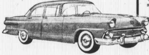
New MAINLINE Series... Each of the three Mainline beauties offers the same engineering advancements, the same graceful contours and clean lines that distinguish all '55 Fords. Fordor Sedan is illustrated above.

When you come in, don't be surprised if you tell yourself: why look farther—why delay—you just can't buy better than Ford.