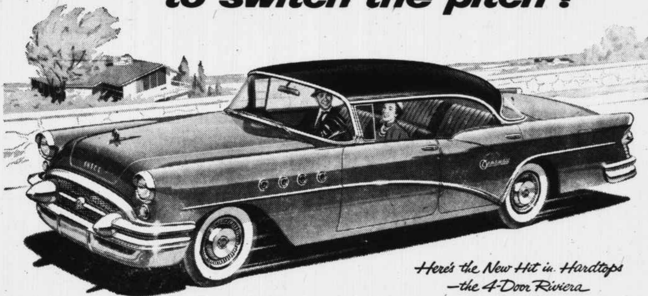
Here's the New Hit in Hardtops — the 4-Door Riviera

Want to do what a pilot does when he clears for take-off?