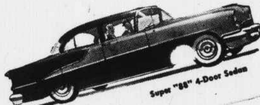
Super "88" 4-Door Sedan