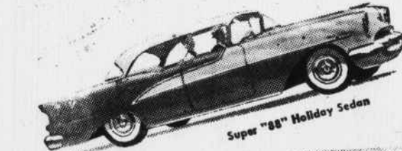
Super "88" Holiday Sedan