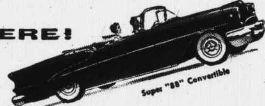
Super "88" Convertible