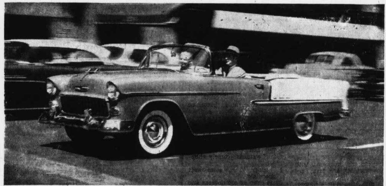
Great Features back up Chevrolet Performance: Anti-Dive Braking—Ball-Race Steering—Out-rigger Rear Springs—Body by Fisher—12-Volt Electrical System—Nine Engine-Drive Choices.

When you need a quick sprint for safer passing, this V8 delivers! It's pure dynamite, and you have to go way, way up the price ladder before you ever find its equal.