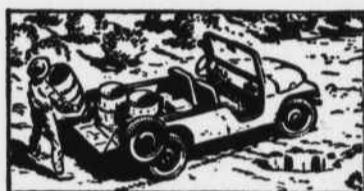
Now a 'Jeep' with longer wheelbase —the new model CJ-6. Carries larger, bulkier loads; has all the features that made the 'Jeep' famous.

A 4-Wheel-Drive Universal 'Jeep' takes you to the job, wherever it is—on the road or off! This rugged performer carries men and equipment over the highway in conventional 2-wheel drive. Then, when work calls for travel off the road—through mud, sand or snow, up hill or down—you shift a single lever for the extra traction of 4-wheel drive. With power take-off, or hydraulic lift, the Universal 'Jeep' does an almost endless variety of jobs. To find out what it can do for you, ask for a demonstration.