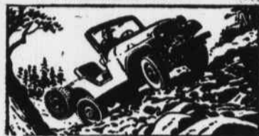
Traction. 4-wheel drive gives the extra traction for traveling up steep grades or broken ground. The 'Jeep' is built to stand up and take it in tough usage.