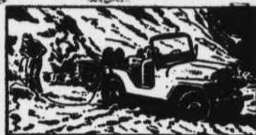
Mobile power. With power take-off, the Universal 'Jeep' provides mobile power for operating welders, compressors, generators and many other kinds of specialized equipment.