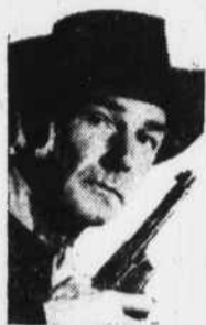
Randolph Scott Plus

BIG Double Feature "THUNDER OVER THE PLAINS" With