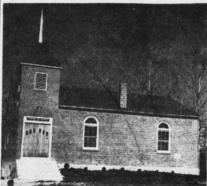
New Prentiss Baptist Church

Dedication of the new Prentiss Baptist Church will be held Sunday.