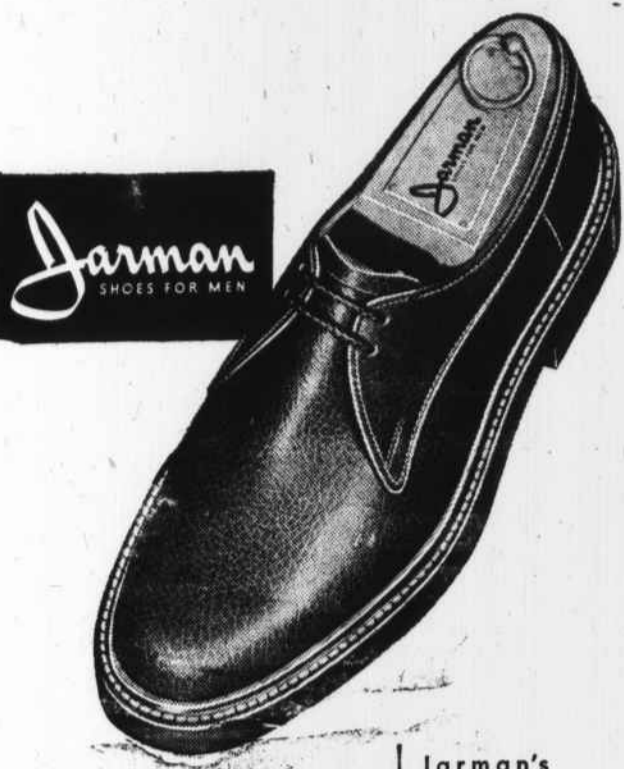
Jarman's Black Continental New Raglan Blucher