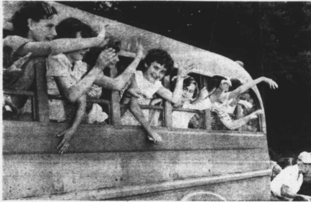
Macon County 4-H Clubbers Leave For Camp Schaub

gram has contributed much to the economic, social, physical, and moral welfare of our county.