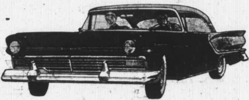
The Fairlane Club Victoria is a brilliant example of the Mark of Tomorrow styling and built-in plus-values that have made Ford the best-selling car in the nation.