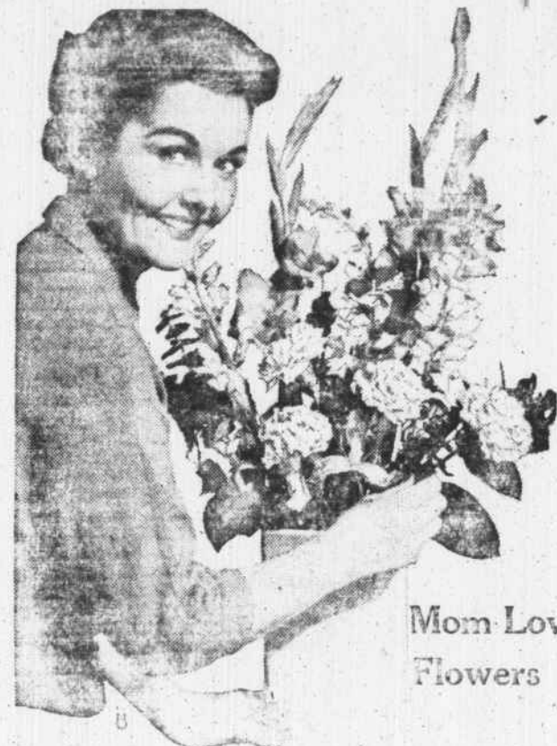
Mom Loves Flowers