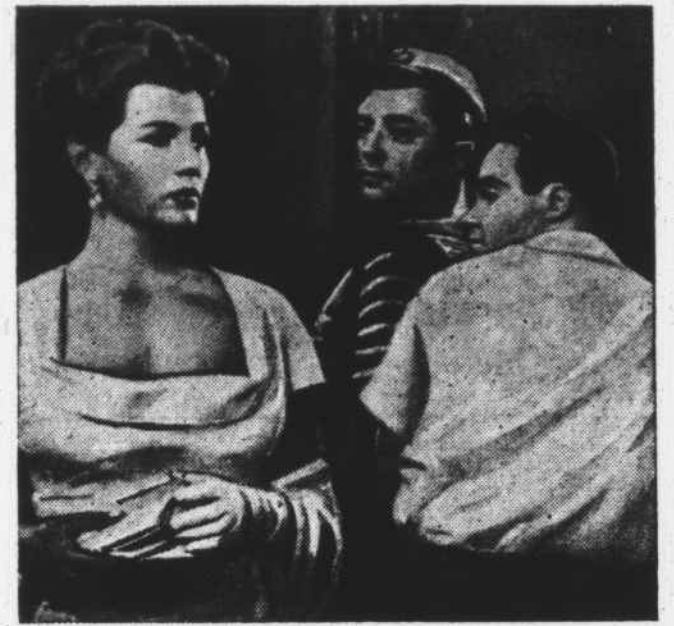
Rita Hayworth, Robert Mitchum and Jack Lemmon in "Fire Down Below" showing Sunday-Tuesday at the Franklin Indoor-Outdoor Theatre. Adv.