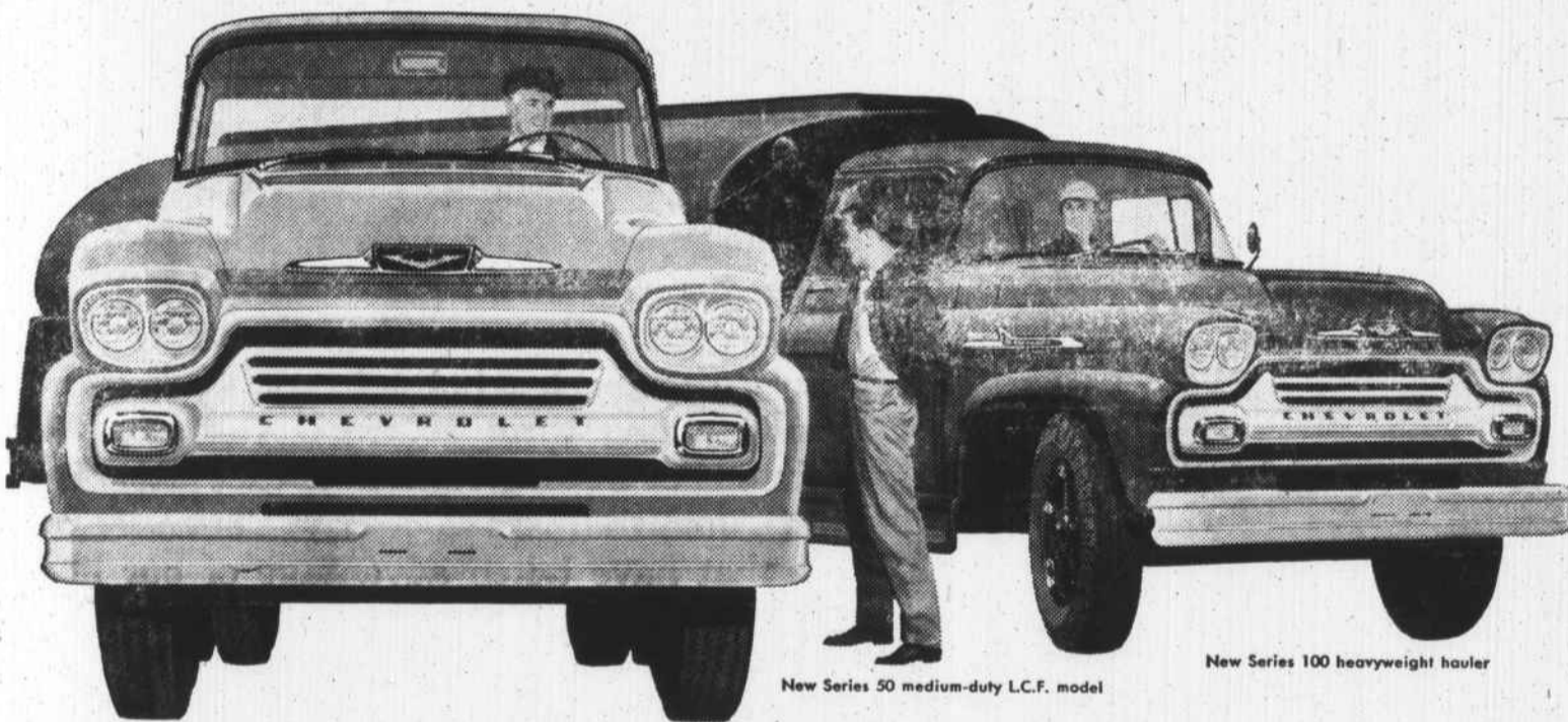
New Series 30 medium-duty L.C.F. model