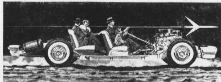
NEW-MATIC RIDE* (A TRUE AIR SUSPENSION) TURNS ROUGH ROADS INTO HIGHWAYS OF SMOOTHNESS

Dual-Range Power Heater* delivers the exact amount of heat or ventilation exactly where and when you want it. You push a button...power does the work!