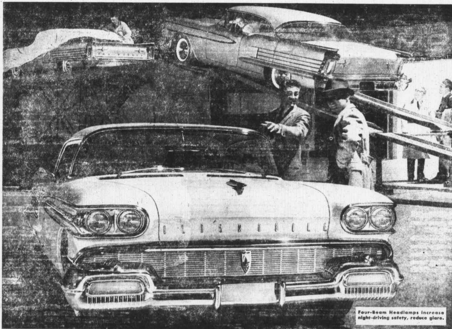
Four-Beam Headlamps increase night-driving safety, reduce glare.

... THE NEW WAY OF GOING PLACES IN THE ROCKET AGE !