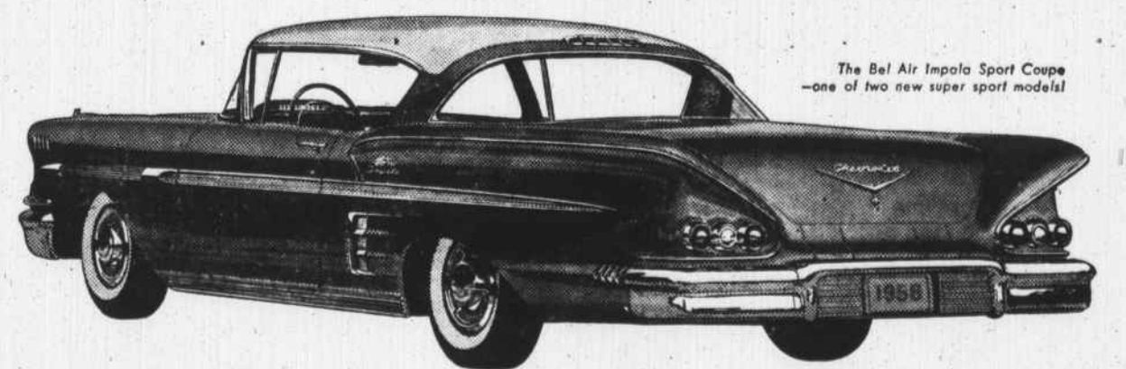
The Bel Air Impala Sport Coupe—one of two new super sport models!

There's never been an engine-drive combination like this one! Chevrolet's Turbo-Thrust V8* introduces a radical new slant on engine efficiency with the combustion chambers located in the block rather than in the head. Turboglide*—the other half of the team—is the only triple-turbine automatic drive in Chevy's field. It takes you from a standstill through cruising in a single sweep of motion. Harness these triple turbines to a 250-h.p. Turbo-Thrust V8—or the 280-h.p. Super Turbo-Thrust*—and you step out instantly in any speed range. Nothing else on the road goes into action so quickly, so smoothly. Your Chevrolet dealer has the combination! '58! CHEVROLET *Optional at extra cost.