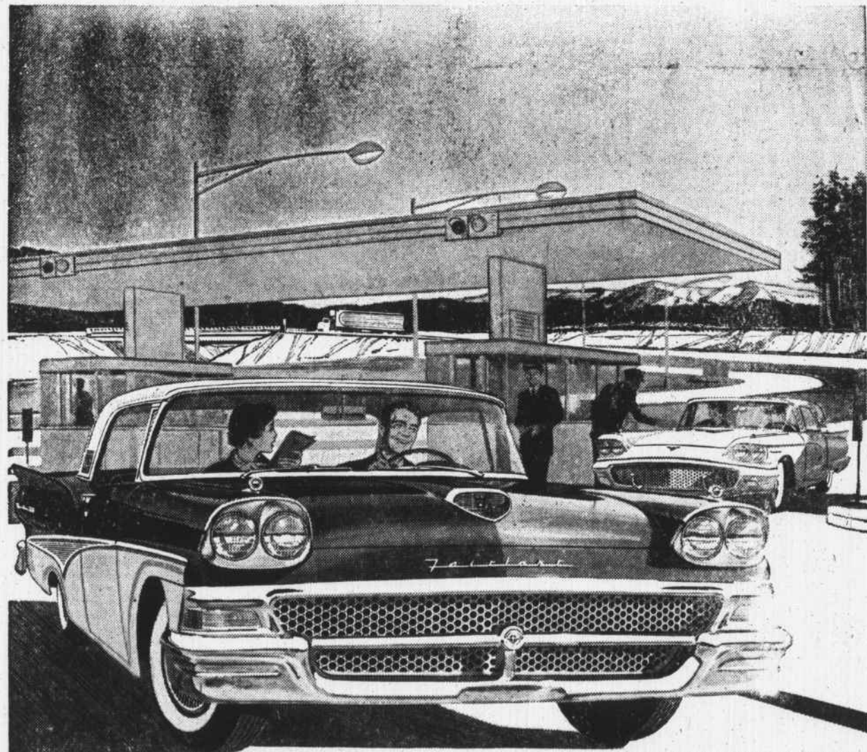
America's only car with a hideaway hardtop—the Ford Skyliner shown here with the fabulous new 4-passenger Thunderbird

SANIBEL-WAVECREST On the World's Most Famous Beach DAYTONA BEACH, FLORIDA